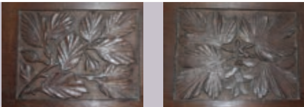
Panelling designed by H H Holden

A comprehensive Church booklet, can be found in Church, gives details of the history and the contents of the Church to bring your visit alive.